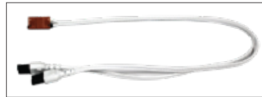
Dual Connecting Cord, 18" ECODUAL2-18