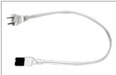
Power Cord with Plug, 12" with Switch ECOPC2-12