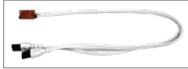
Dual Connecting Cord (Standard), 32" ECOCC12