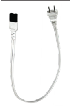
Power Cord, 15A, 25" with Switch POWERCORD-W-SWITCH